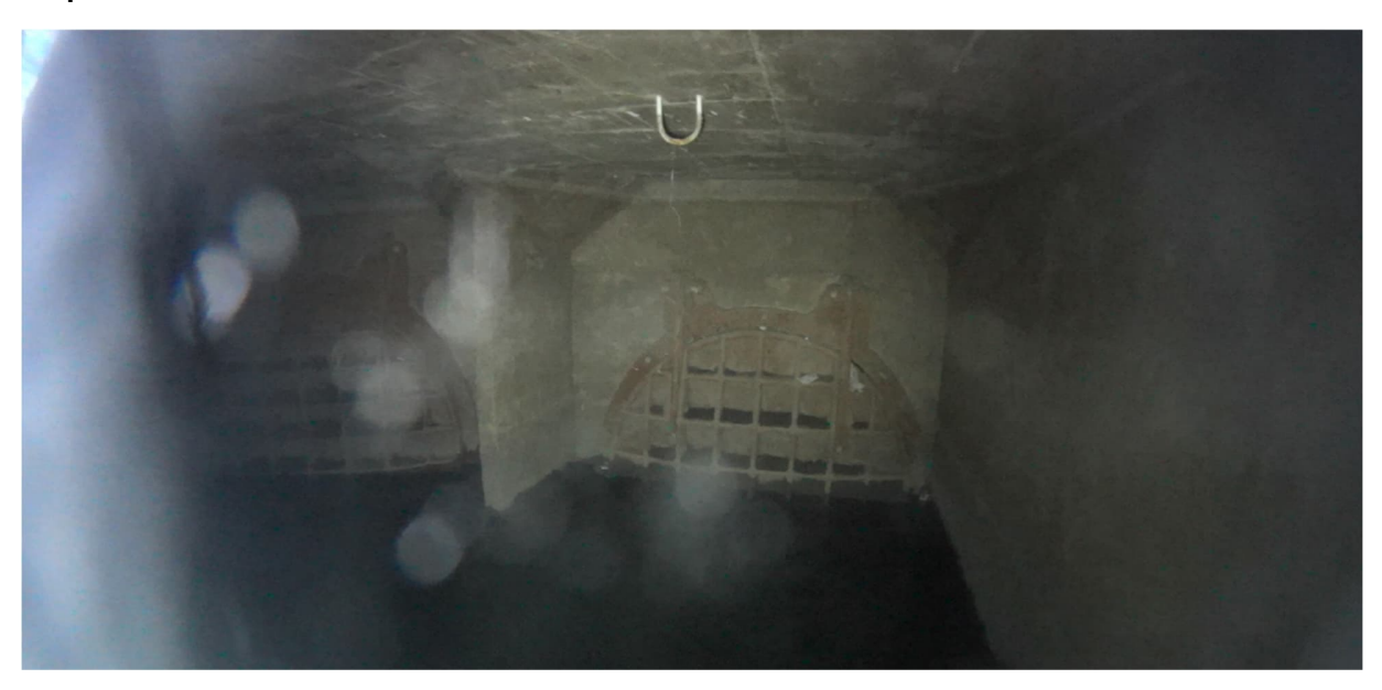
12 - Existing Flap Gate Chamber, Looking Upstream