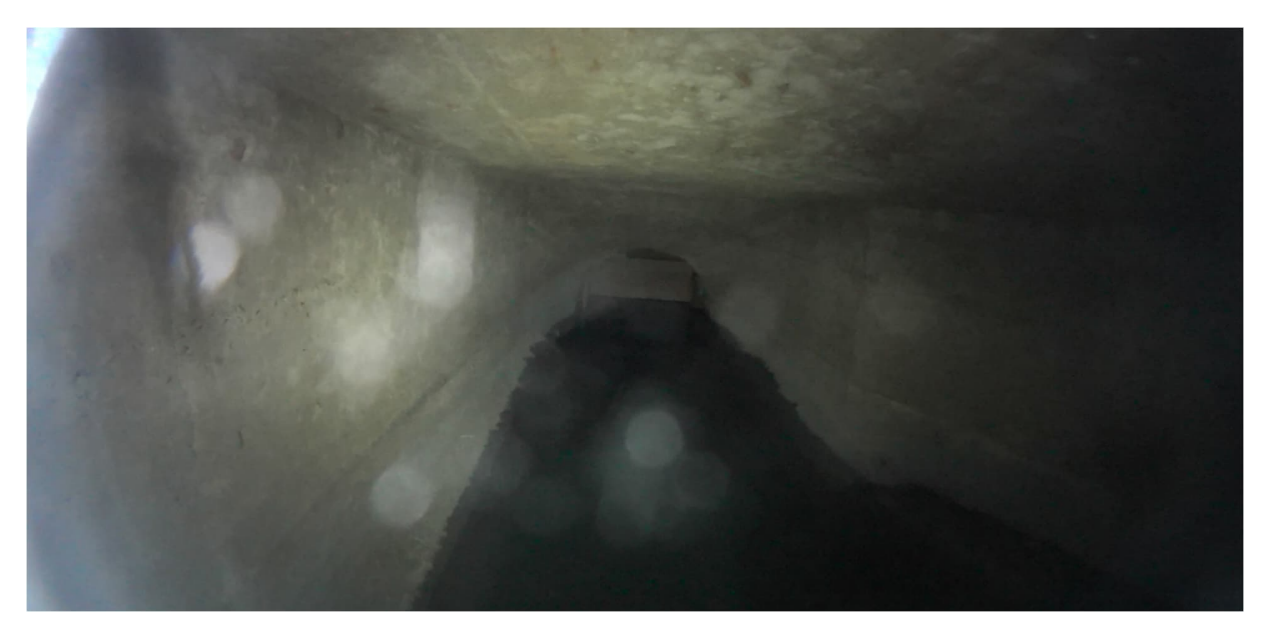
15 - Existing Flap Gate Chamber, Looking Downstream