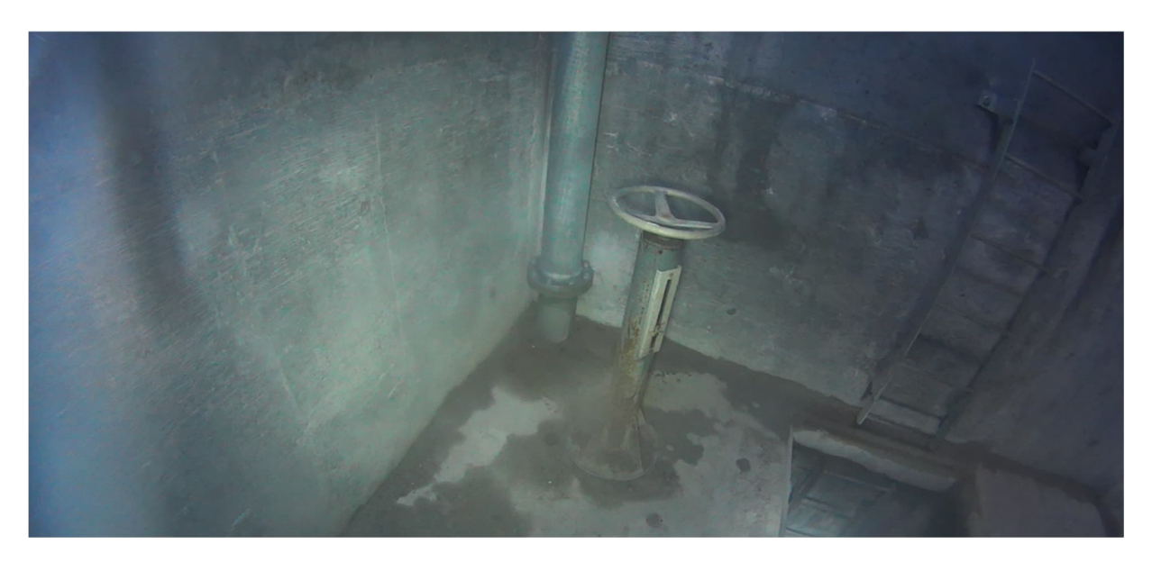
01 - Existing Pump Chamber Upper Level Platform