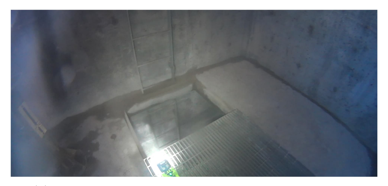
02 - Existing Pump Chamber Upper Level Platform