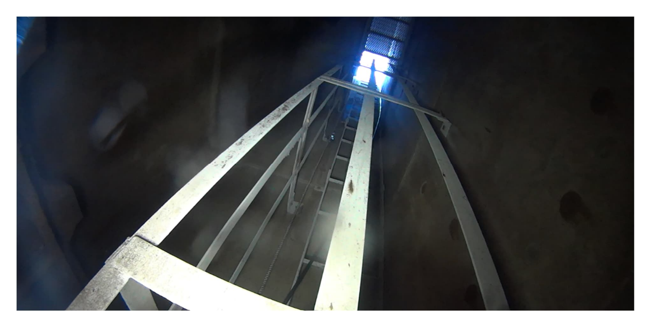
09 - Existing Slide Gate Chamber Lower Level, Downstream