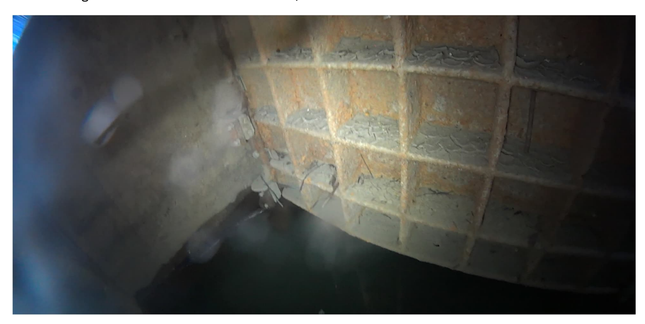
{\tt 08} - Existing Slide Gate Chamber Lower Level, Downstream