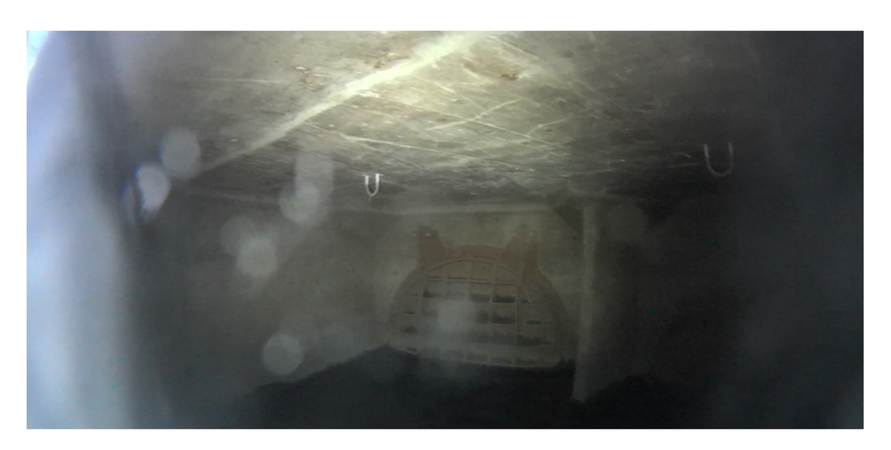
14 - Existing Flap Gate Chamber, Looking Upstream