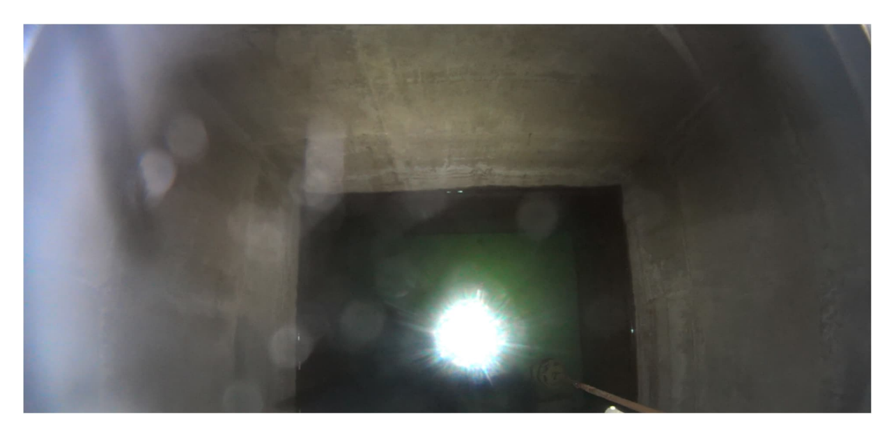
03 - Existing Pump Chamber Lower Level