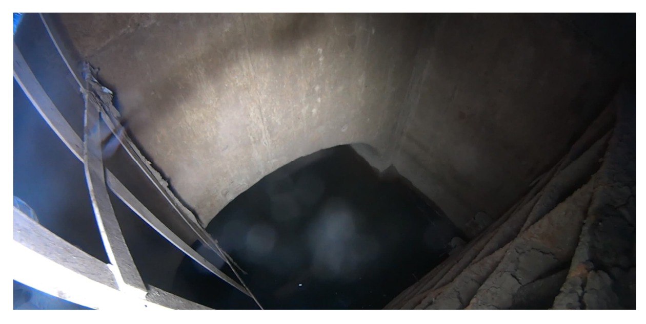
05 - Existing Slide Gate Chamber Lower Level, Downstream