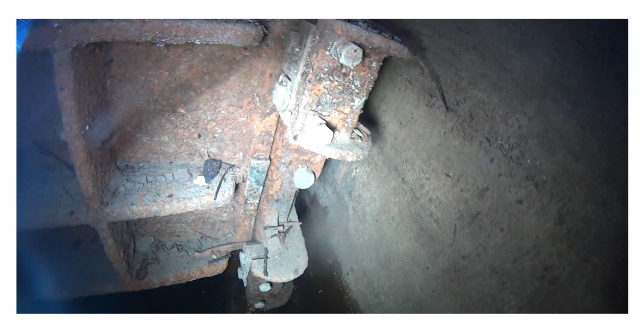
{\tt 07} - Existing Slide Gate Chamber Lower Level, Downstream