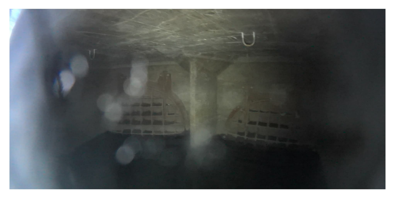
13 - Existing Flap Gate Chamber, Looking Upstream