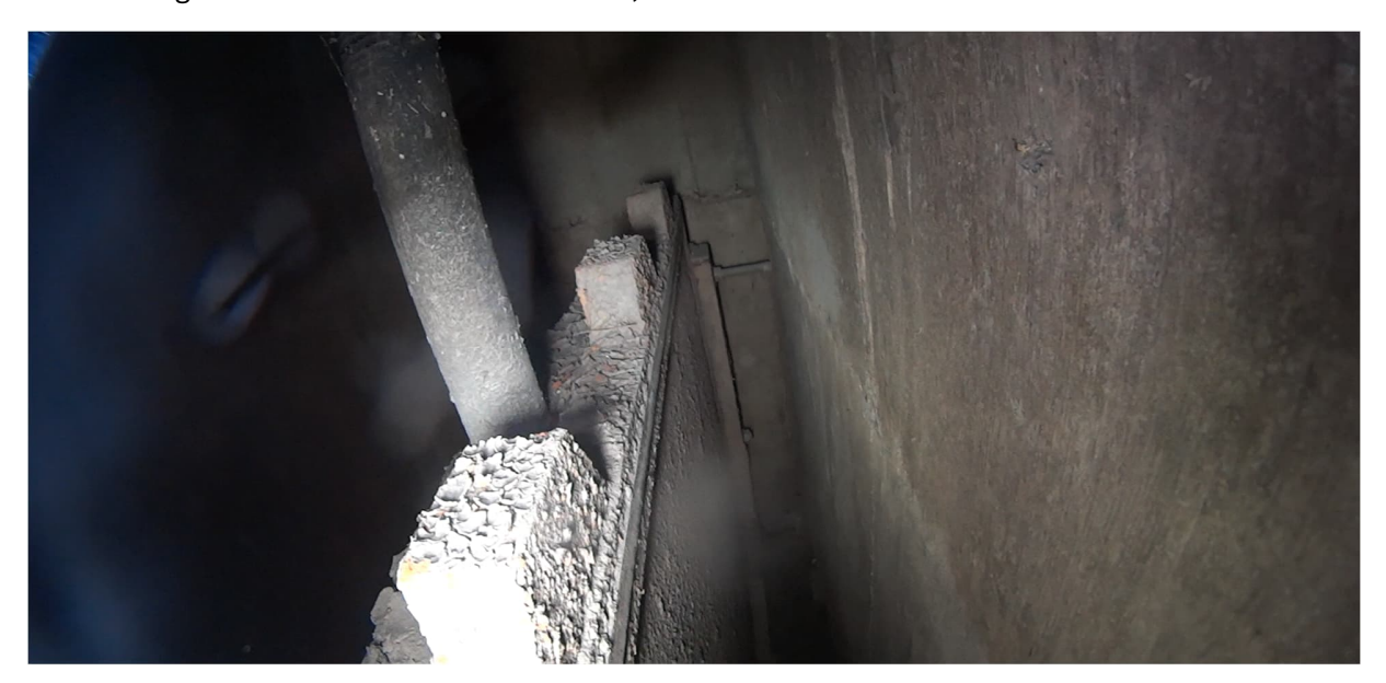
06 - Existing Slide Gate Chamber Lower Level, Downstream