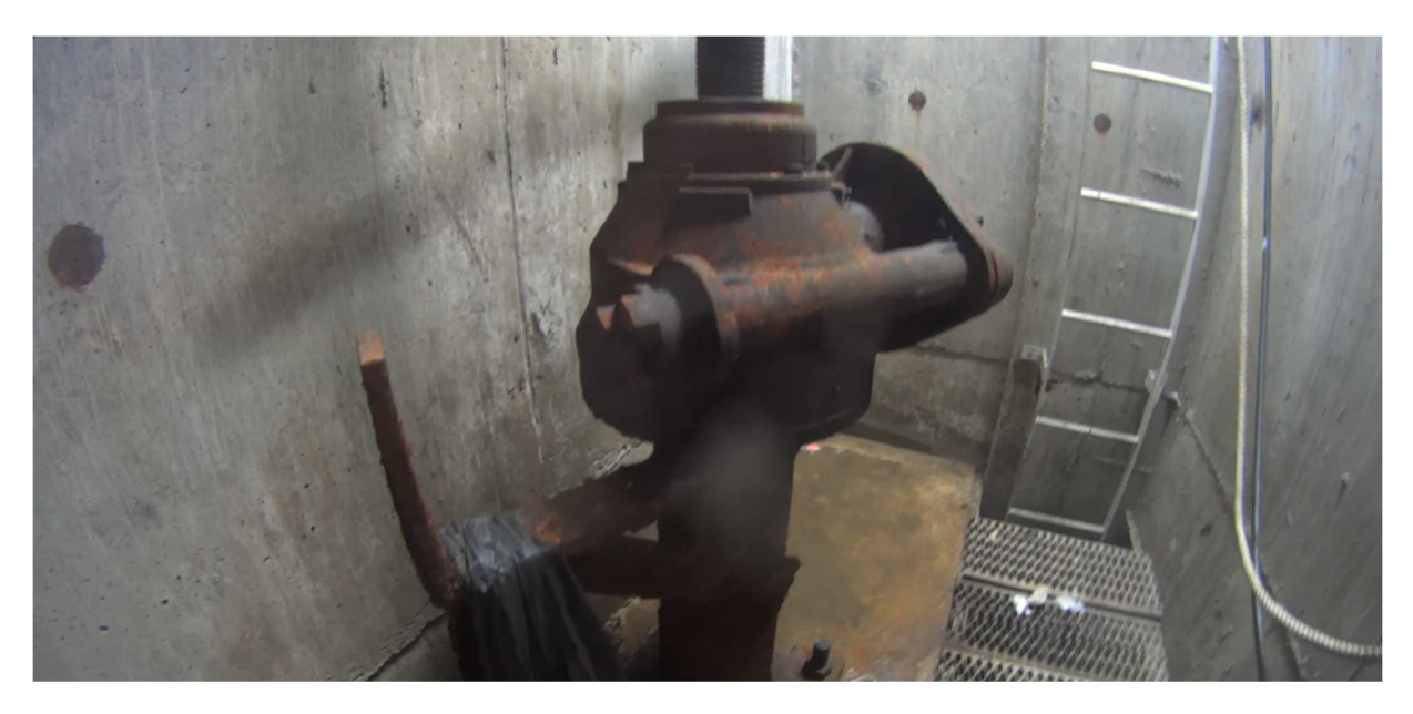
10 - Existing Slide Gate Chamber Upper Level, Downstream